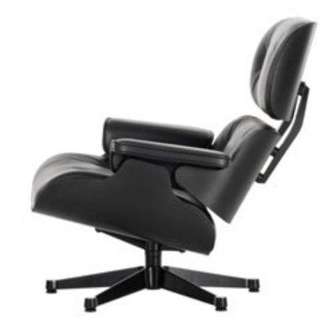
Lounge Chair (classic version)